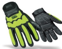
Fire Resistant Gloves