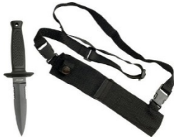
Harness Knife & Sheath