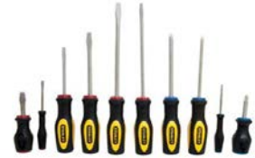
Set of Assorted Screwdrivers