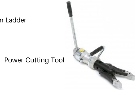
Power Cutting Tool