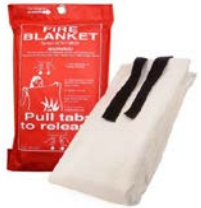
Fire Resistant Blanket