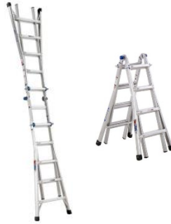
17-ft Multi-Position Ladder