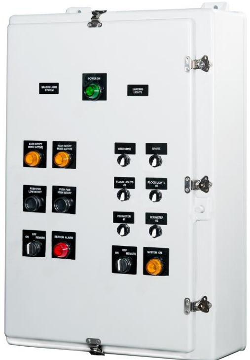
MARINE HELIDECK LIGHTING CONTROLLER PHC-61001-AC-M-SL Integral PSL Status Light System Control Unit