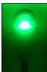
CLEAR LENS BUT GREEN LIGHT PRODUCED

PEL-57007-1C-G-34B Mounts on 3/4-inch conduit