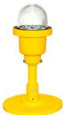
PEL-57005-1C-G-14 WITH TRADITIONAL FAA FRANGIBLE COUPLING

Includes our standard yellow Marine Treatment finish at no additional charge which tolerates marine, high salt content air and other corrosive environments. The FAA specified finish used by competitors flakes and fails in a short time under such conditions.