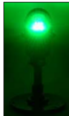
CLEAR LENS BUT GREEN LIGHT PRODUCED COLOR CODED LED BOARD